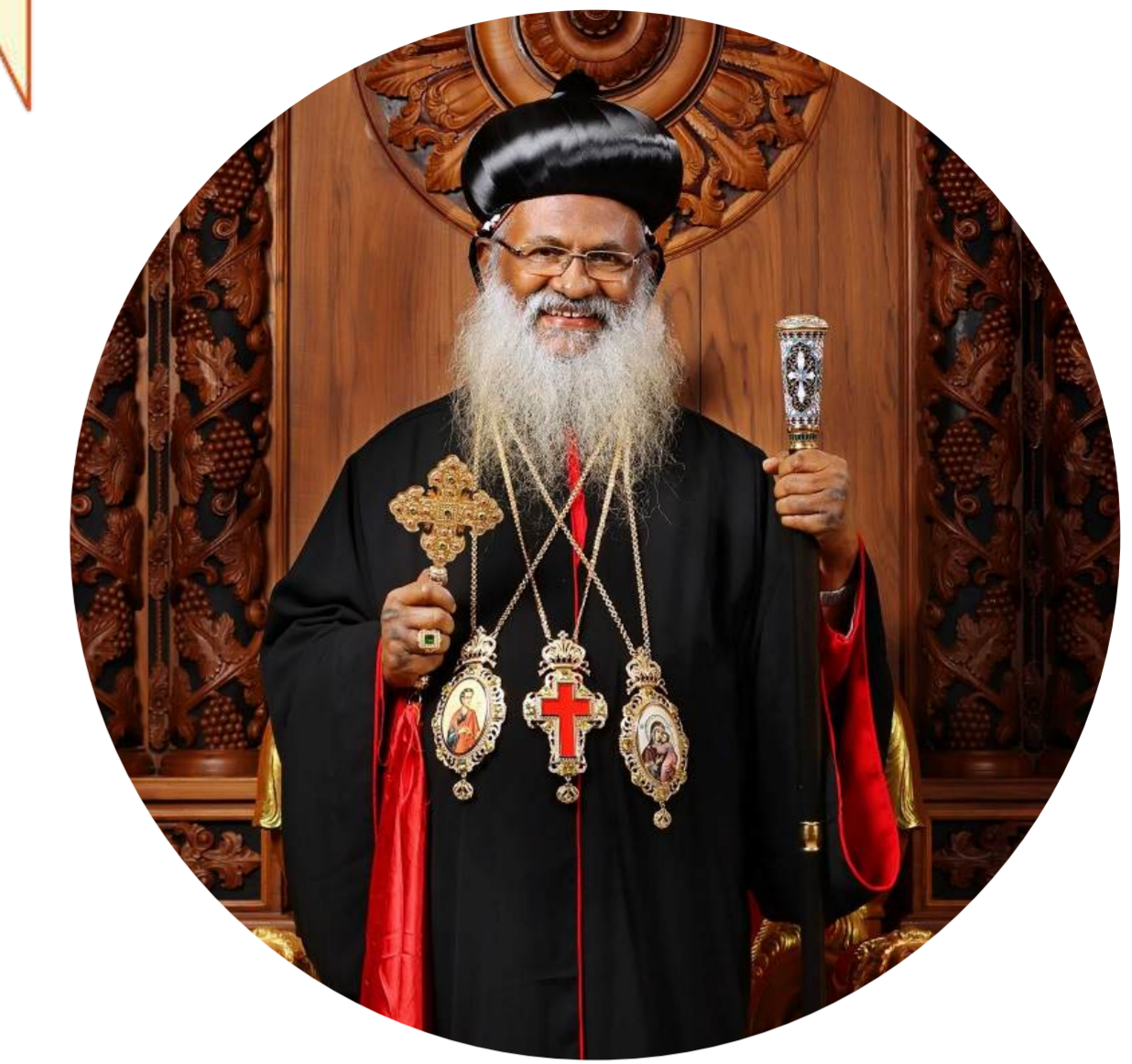
H.H. Baselios Marthoma Mathews III Catholicos of the East & Malankara Metropolitan